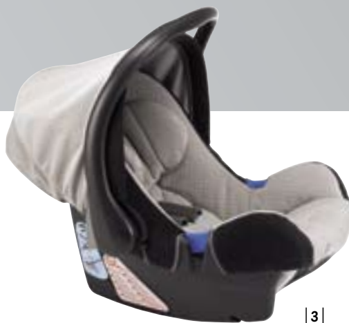
| 3 |