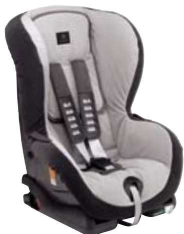
| 1 |