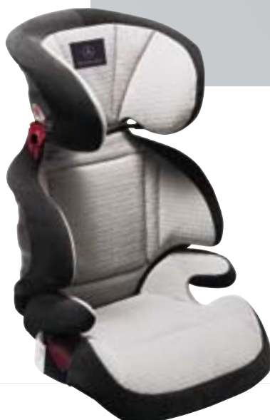
| 2 |